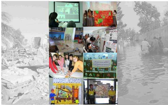
Disaster Risk Education brings the whole world together

Students will create a Disaster Safety Map of their school’s surrounding areas.