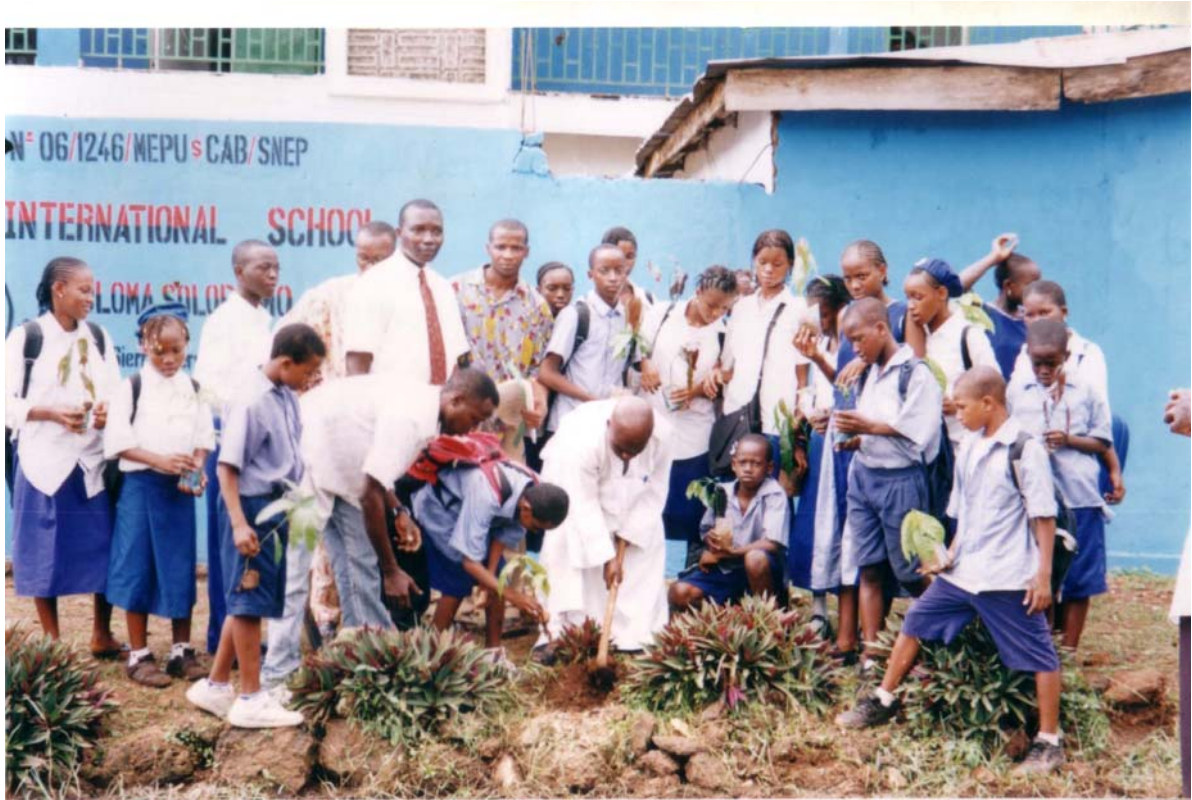
Teachers and pupils from the Sierra International School are planting trees in Guinea-Conakry