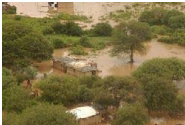
Damages caused by the Pilcomayo River

The Pilcomayo River increased its wealth causing a flood in Santa Maria and also in Santa Victoria East side (south of Bolivia and north of Argentina). The flood was not dangerous enough to make the Center for the Citizen Protection(CCP) evacuate the residents. The Government planed an air-way to assist the more than 3.500 people who are isolated. People in there are being given shoes, food, mattress and medical assistance. This plan will be working till the river decrease its wealth which is now 6.20 meters.