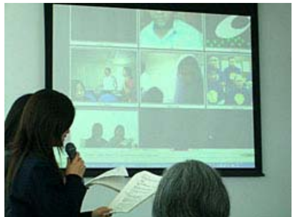
VC at Disaster Reduction and Human Renovation Institution in Kobe, Japan. http://ndys.jearn.jp/vc.html

Their schools will be the center of community education for disaster management. We also expect teachers and civic volunteers to support students' with learning and activities. As the final event of the project, we will get together in Turkiye, and hold the International Conference ' NDYS 2010 in Turkiye'.