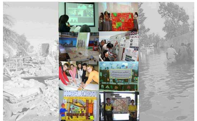
Disaster Risk Education brings the whole world together

To achieve this goal, we plan two programs.