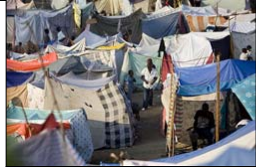
This is how they live now. Space and

The government has identified at least 30 sites to turn into temporary tent communities in Port-au-Prince, most in areas where people are already