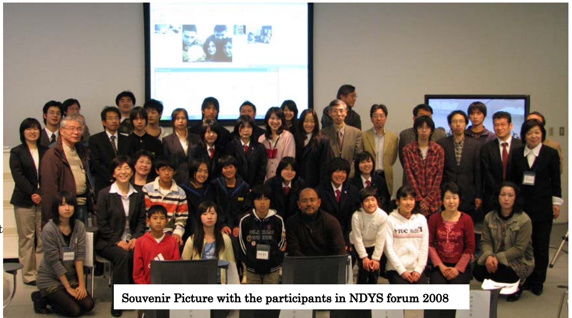
Souvenir Picture with the participants in NDYS forum 2008

how support from sea is important. In the second part, we had panel discussion. Students who presented their works today became panelists and exchange opinions each other on disaster reduction and global warming issues. The day became very productive for all of participants, and we got much more knowledge.