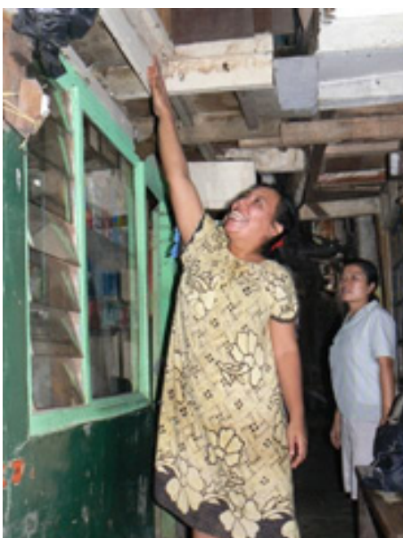
Here a housewife who shows how the water reached to the first floor in this poor area.