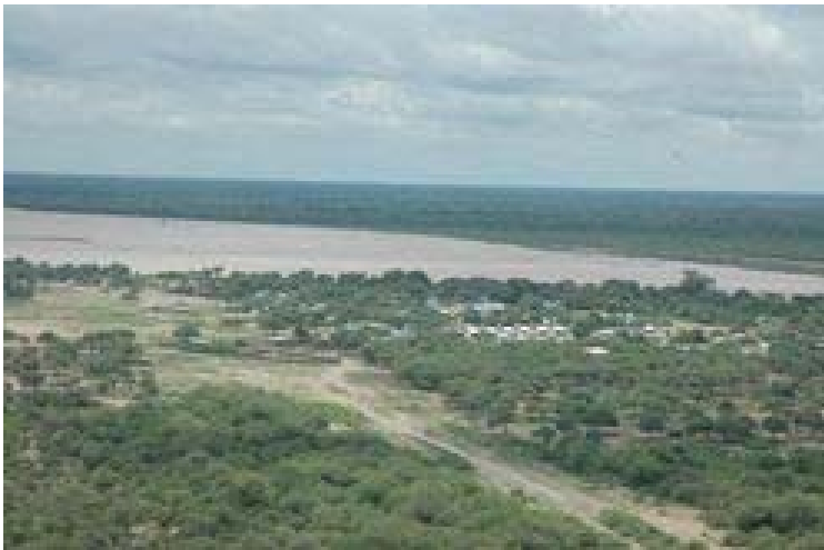
The North region is affected by the flood

There are at least 250 families which now are isolated. More healthy tools are being sent to them. It is a miracle that the water didn't reach to houses.