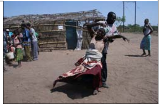
Some simulation exercises were practiced.

Over 45,000 people are marooned in the two adjacent sub-districts of Dacope (Khulna District) and Shyamnagar (Satkhira District), areas which were also among the worst hit by Aila.