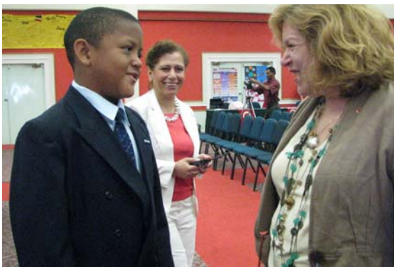
Trinidad and Tobago