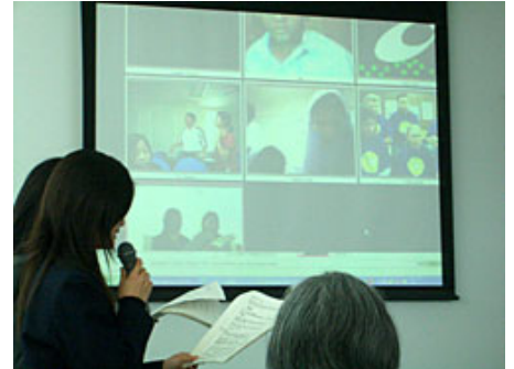
Video conference at "Hyogo e-school" on Disaster Reduction and Human Renovation Institution

We used Internet forums including BBS for creating a world educational network and for using video conferences as tools for collaborative learning to exchange information. Using these tools, we can promote disaster reduction learning programs, wherein children around the world can work together on global issues.