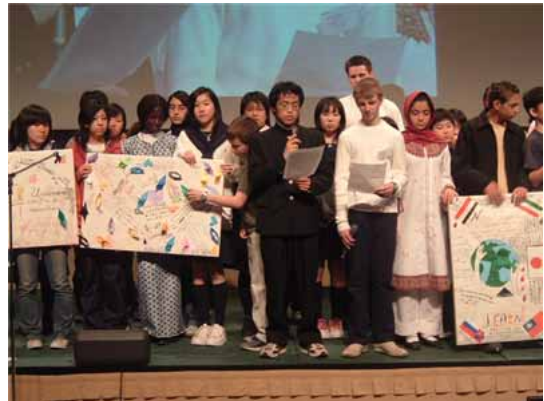
NDYS 2005 Declaration