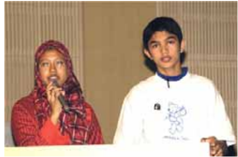
NDYS 2005: Report The Raging Tsunami Mangrove Ache Darussalam, Indonesia

NDYS will build networks for the sharing of disaster prevention through disaster management education utilizing Information and Communication Technology (ICT).