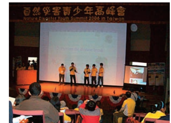
NDYS2006 : connecting Taiwan and Kobe, Japan

Let's have video conference several times, so that everyone can meet each other.